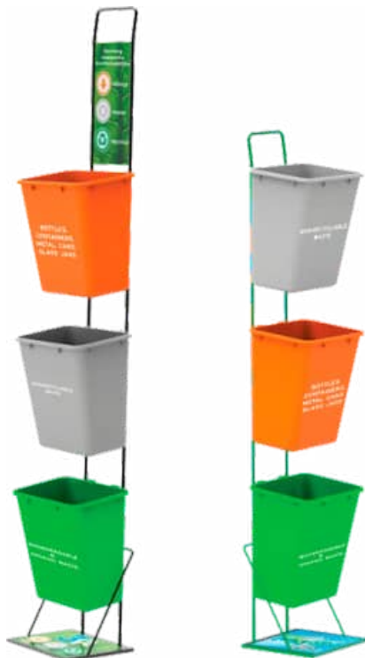
24A VERTICAL BIN STAND