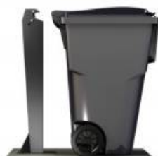
Unlocked trash can for unloading