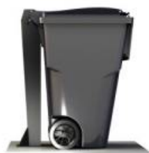
Locked trash can