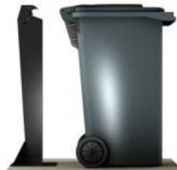
Unlocked trash can for unloading