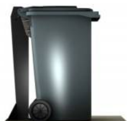
Locked trash can